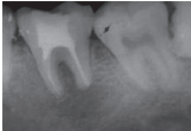
Fig. 3: Eight months postoperative

periapical granuloma, the epithelium is found close to the periodontal ligament. In course of time the epithelium undergoes proliferation by the inflammatory stimuli and shows an attempt to wall off the irritant coming out through the apical foramen, which becomes extensive and presents as sheets of stratified squamous epithelial cells as well as anastomosing cords.