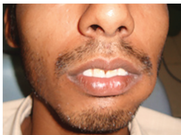
Fig. 1: Extraoral view